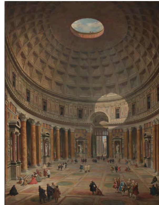
INTERIOR OF THE PANTHEON, ROME

When we first saw this painting, we noticed the hole at the top of the dome. When we looked closer, we saw two fig-