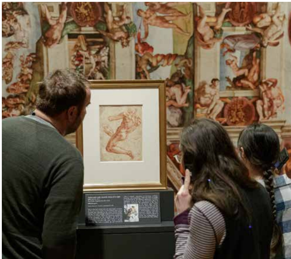
Visitors enjoy Michelangelo: Mind of the Master