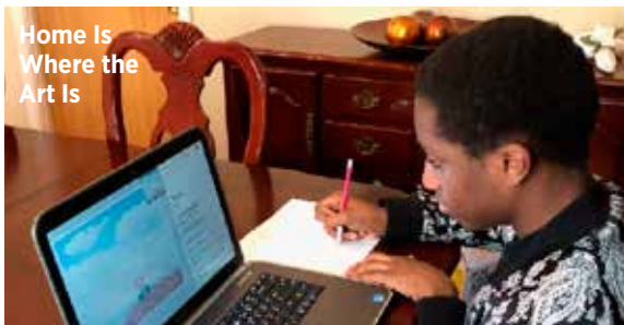
Home Is Where the Art Is

The museum closed Saturday, March 14, as the world grappled with fallout from the coronavirus pandemic.