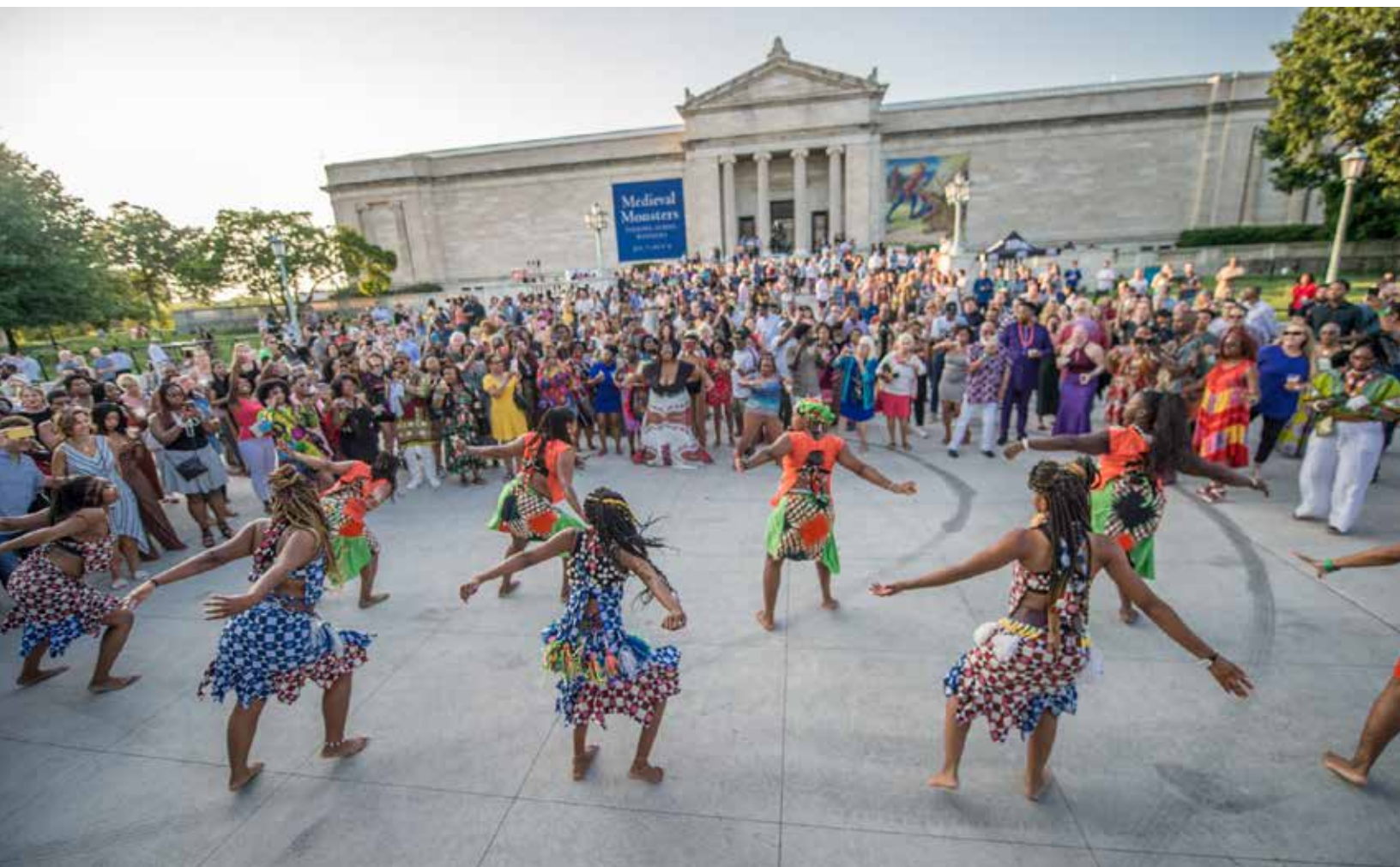
Performance at MIX Lagos, featuring artist Emeka Ogboh, August 2019