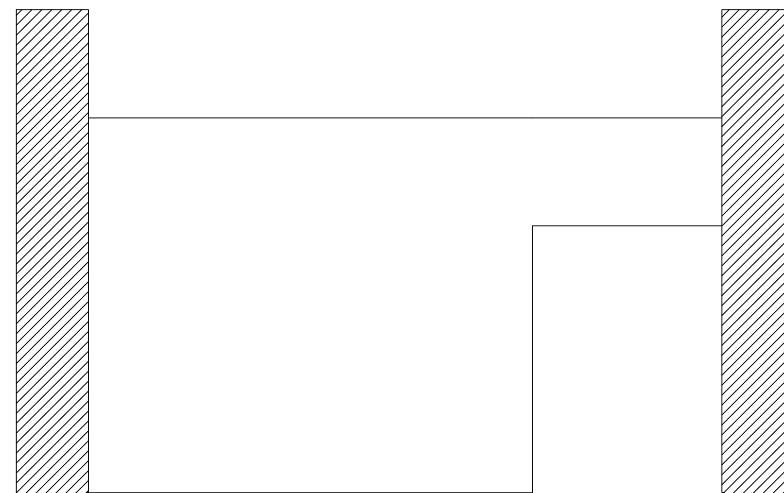
Division Between Sculpture and drawing galleries with door header - creates a stronger division between spaces