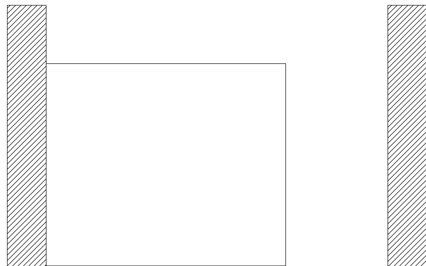
Division Between Sculpture and drawing galleries without header - creates a more open environment