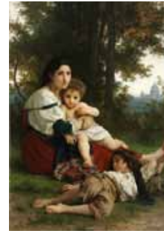
Rest , 1879. William Adolphe Bouguereau (French, 1825-1905). Hinman B. Hurlbut Collection 432.1915

The subject of this work by Claude Monet is his wife, Camille. He captures an image of her through a window during a fleeting moment in time. Use this painting to have students start their own stories. What does Camille see through the window? Where is she going? What will she do?