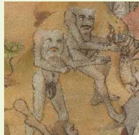
Livre des merveilles du monde (Book of Marvels of the World), in French, c. 1460. Illuminated by the Master of the Geneva Boccaccio. France, Angers. Ink and tempera on vellum. The Morgan Library & Museum, Purchased by Pierpont Morgan (1837–1913), 1911, MS M.461 (fol. 26v–27r)

Blemmyes headless people whose facial features are on their chest. During the Middle Ages, blemmyes were thought to inhabit Africa and later, India.